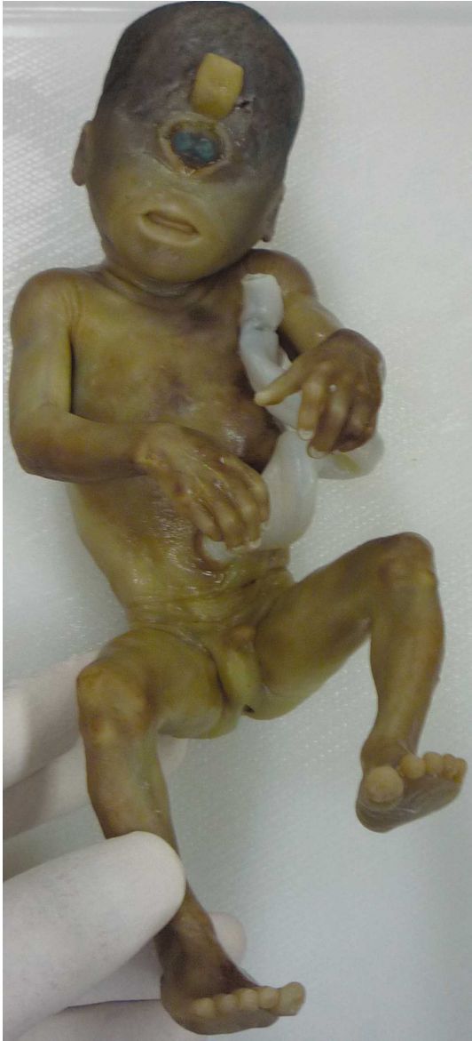
Fig. 1. General view of 21-week fetus with cyclopia and synophthalmia.