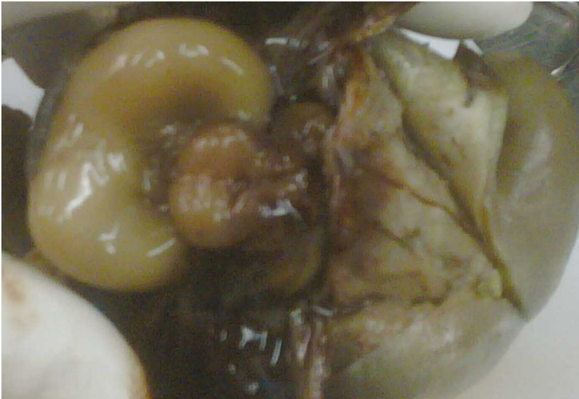
Fig. 5. Alobar holoprosencephaly in anatomical post-mortem evaluation.