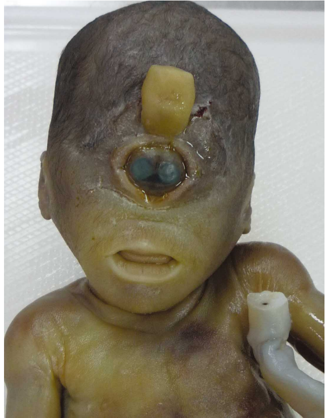
Fig. 2. Fetus with cyclopia and synophthalmia, note the presence of two irises in one orbit.

by a bridge of cortical tissue with agenesis of the corpus callosum, the evidence a great single ventricular occupies 40 percent of the brain, a single fusion brain hemisphere and a court shows a large single ventricular cavity drain extra fluids, brain structure occupies a third of the cranial cavity, the hemispheres are seen fused with poor differentiation of convolutions with cerebellar heterotopias and brain stem, brain measures 2.5 x 2 inches and fused thalami.